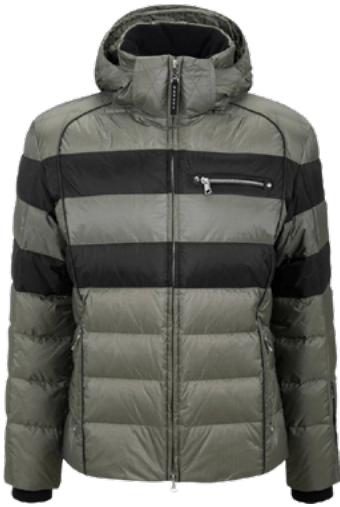
OLIVE STRIPED PUFFER