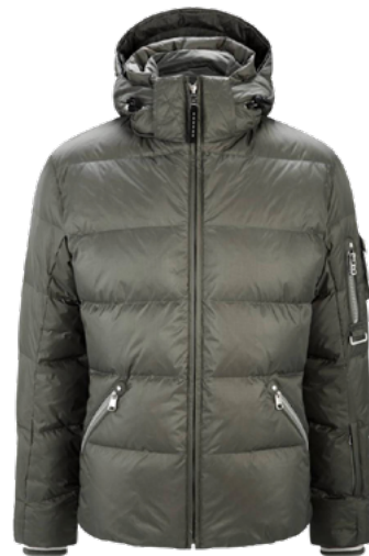
OLIVE PUFFER JACKET

This vibrant red puffer jacket features a sleek design with a zip closure and a stand-up collar. It includes zip pockets and elasticized cuffs, crafted from water-resistant fabric for warmth.