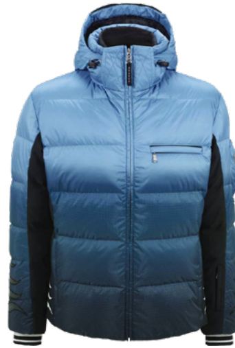
BLUE OMBRE PUFFER

This puffer jacket features a striking olive and black striped pattern with a zipper closure. It includes zip pockets, a stand-up collar, and elasticized cuffs for a functional yet stylish fit.