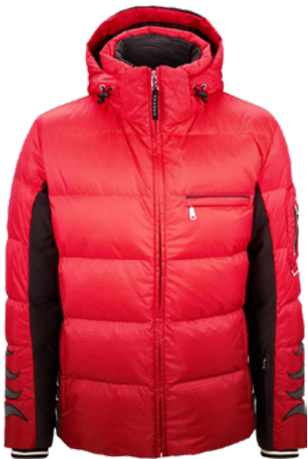
RED PUFFER JACKET

This puffer jacket features a striking blue ombre pattern with a zipper closure and a stand-up collar. It includes zip pockets and elasticized cuffs, crafted from water-resistant fabric for warmth.